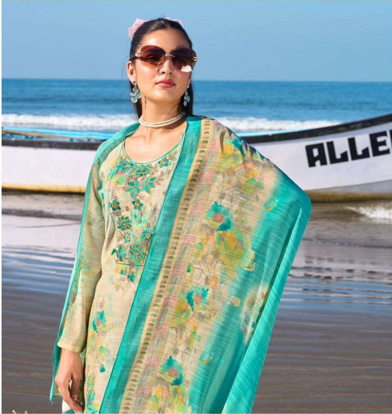
SCARLET FEVER A blend of colors that highlight every corner of the attractive designs that in turn adorn you with cast beauty