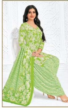
D No. 2728