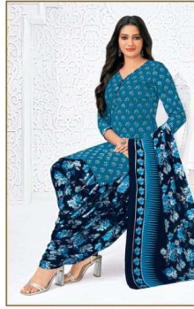
D No. 2733