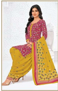
D No. 2737