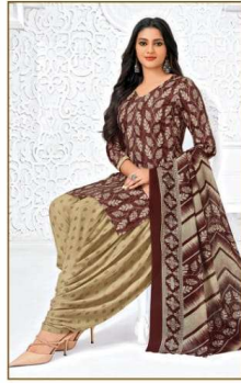
D No. 2729