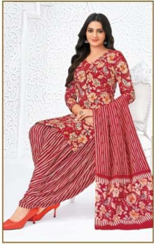
D No. 2727