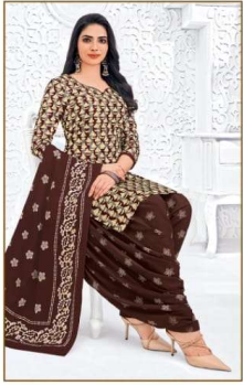
D No. 2732