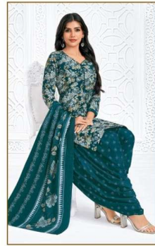
D No. 2740