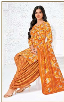
D No. 2741