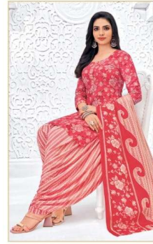
D No. 2731