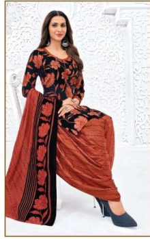
D No. 2734