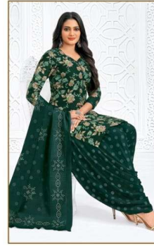
D No. 2736