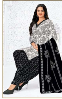
D No. 2735