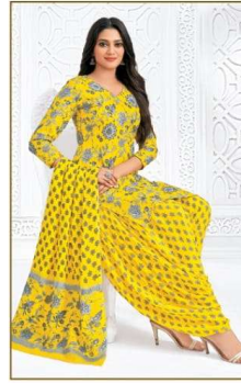
D No. 2730