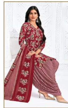
D No. 2742