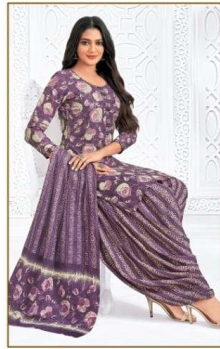
D No. 2738