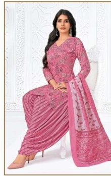
D No. 2739