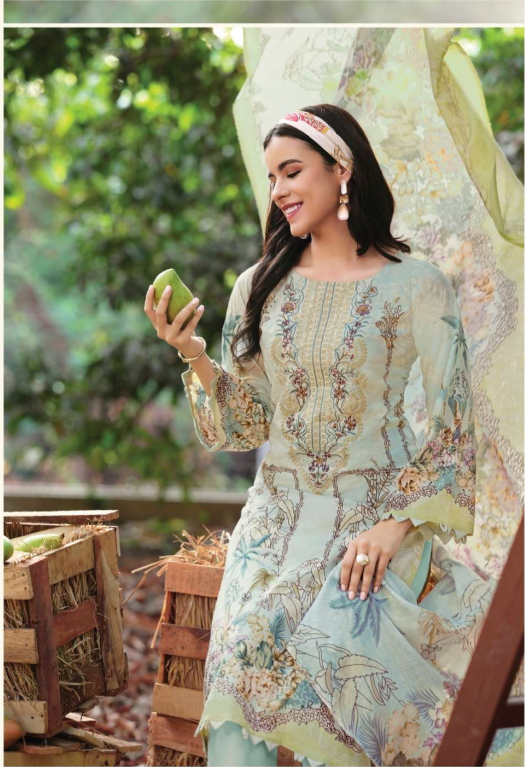
Style is not defined by brands or price tags; it is defined by how you carry yourself, how you combine pieces, and how unapologetically you embrace your individuality.