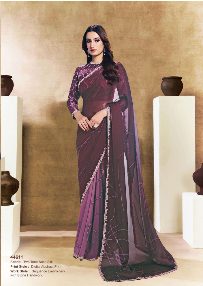
44611 Fabric : Two Tone Satin Silk Print Style : Digital Abstract Print Work Style : Sequence Embroidery with Stone Handwork.