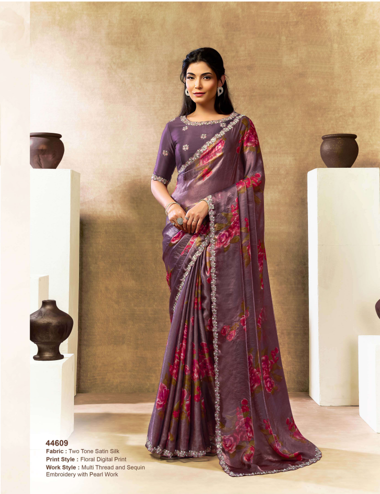
44609 Fabric : Two Tone Satin Silk Print Style : Floral Digital Print Work Style : Multi Thread and Sequin Embroidery with Pearl Work