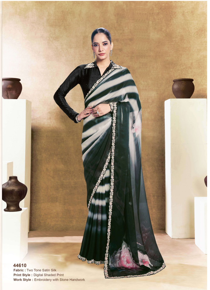
44610 Fabric : Two Tone Satin Silk Print Style : Digital Shaded Print Work Style : Embroidery with Stone Handwork