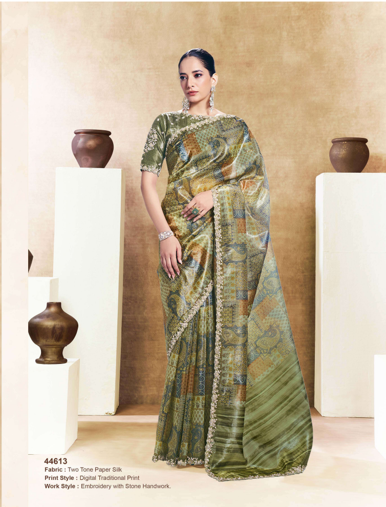
44613 Fabric : Two Tone Paper Silk Print Style : Digital Traditional Print Work Style : Embroidery with Stone Handwork.