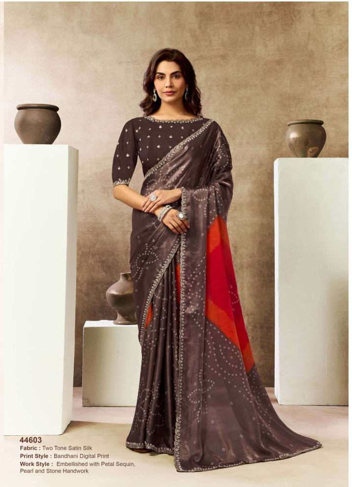
44603 Fabric : Two Tone Satin Silk Print Style : Bandhani Digital Print Work Style : Embellished with Petal Sequin, Pearl and Stone Handwork