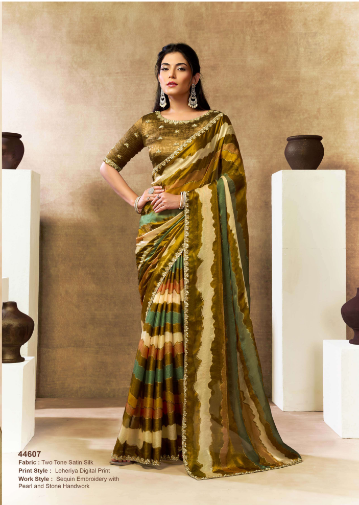
44607 Fabric : Two Tone Satin Silk Print Style : Leheriya Digital Print Work Style : Sequin Embroidery with Pearl and Stone Handwork