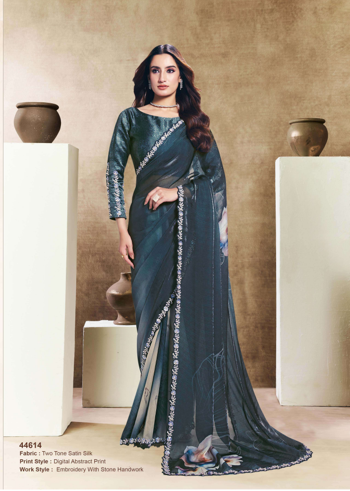
44614 Fabric : Two Tone Satin Silk Print Style : Digital Abstract Print Work Style : Embroidery With Stone Handwork