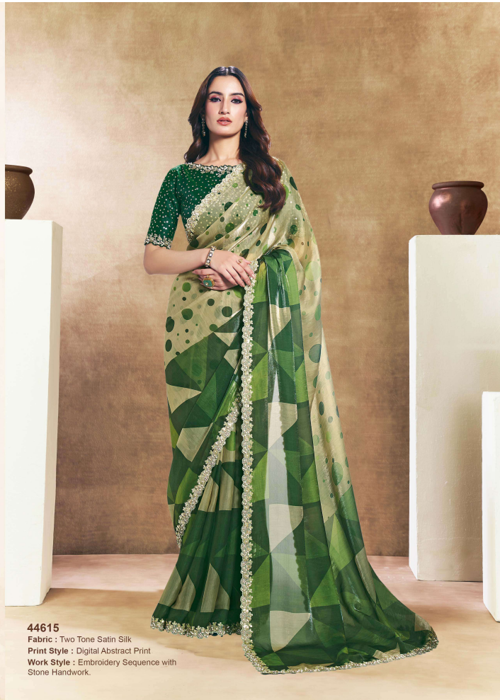
44615 Fabric : Two Tone Satin Silk Print Style : Digital Abstract Print Work Style : Embroidery Sequence with Stone Handwork.