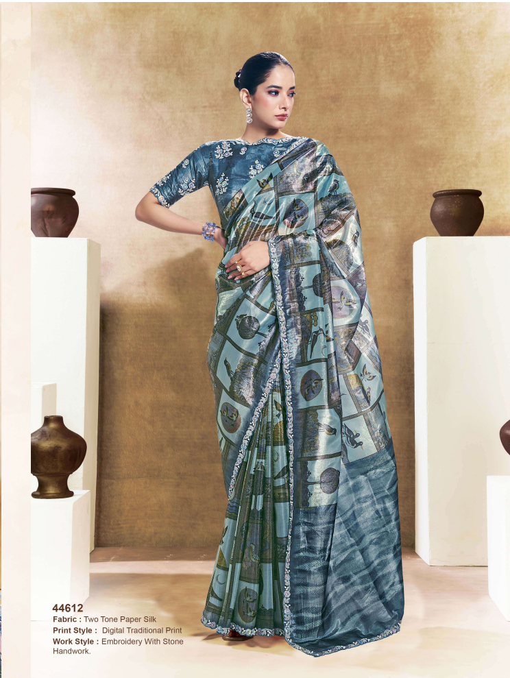
44612 Fabric : Two Tone Paper Silk Print Style : Digital Traditional Print Work Style : Embroidery With Stone Handwork.