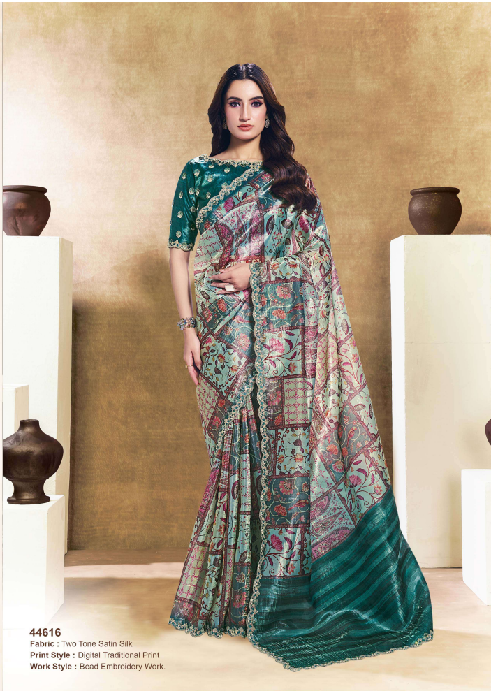
44616 Fabric : Two Tone Satin Silk Print Style : Digital Traditional Print Work Style : Bead Embroidery Work.