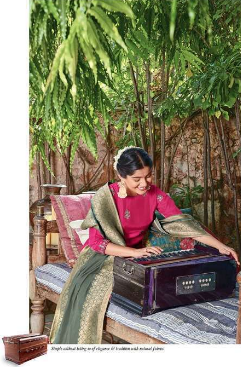
Simple without letting go of elegance & tradition with natural fabrics.